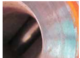
No Corrosion with ALKY-ONE