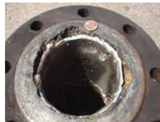
Severe Flange Corrosion